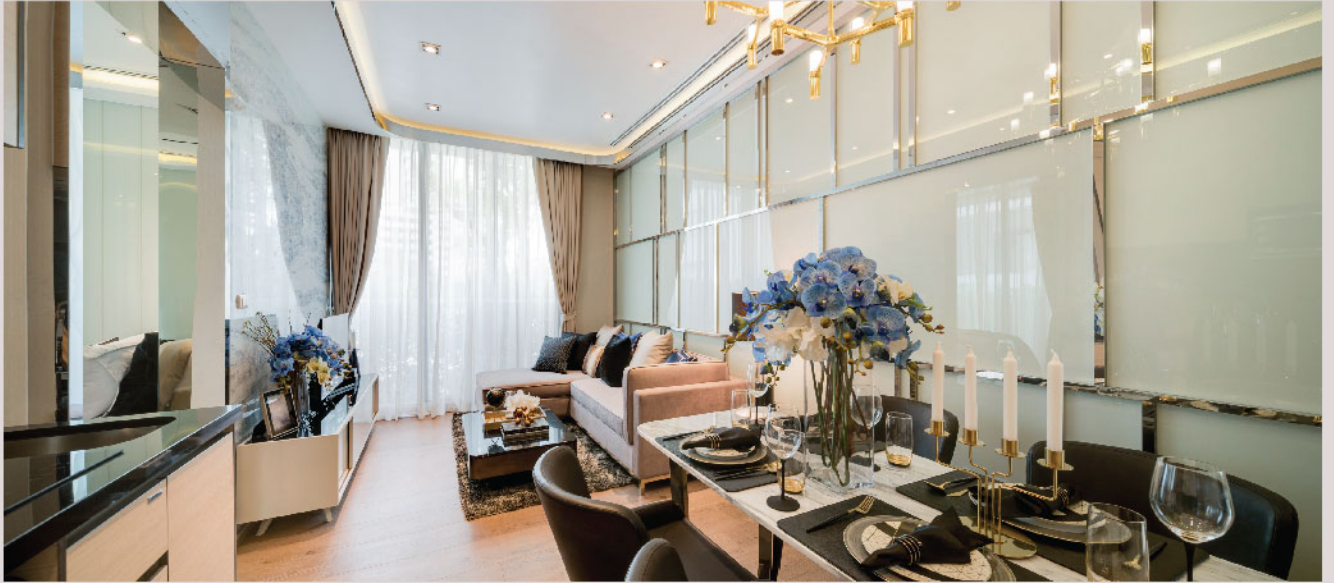
40 SQ.M 1 BEDROOM