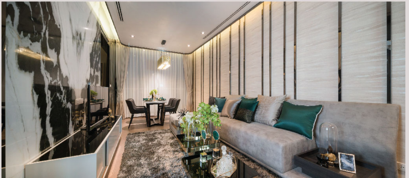
54 SQ.M 2 BEDROOM